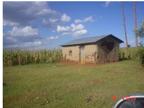
Plate 4: Lone standing housing structure on 100 acres of land in Soy near point H