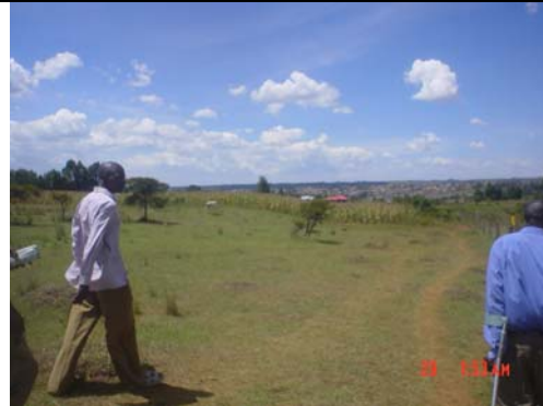
Plate 2: Local community traversing project area between point B and C