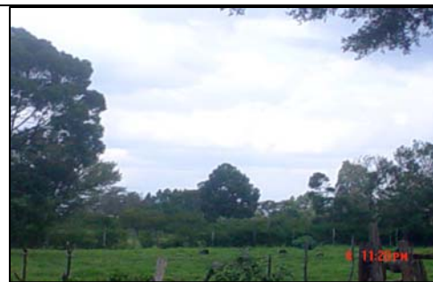
Plate 9: Land with wattle tree plantation at point A3 in Ex-Cullen