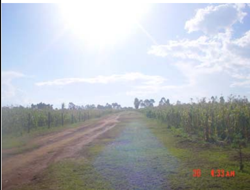
Plate 3: Public infrastructure and maize crop on land earmarked for development in Kamagut area