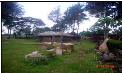
Plate 8: Housing structure at point A3 in Ex-Cullen