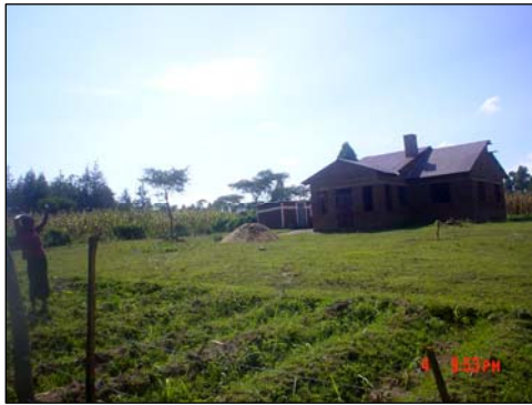
Plate 1: Building Structure located between point B-C